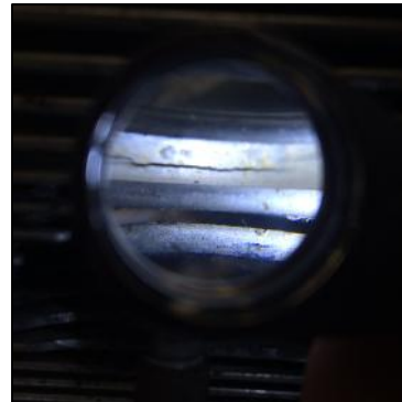
This picture was taken through a 10X magnifying glass. This was also around the cylinder head hold-down.

Reports and Recording. On initial inspection if any cracking is identified flight operations are to be suspended immediately and contact with Jabiru Aircraft Pty Ltd and the completion of a RA-Aus accident report to be submitted. Serviceable parts are to be installed in accordance with the Jabiru engine manuals. On completion of the inspection and if nil defect is evident a similarly worded statement is to be recorded in the aircrafts airframe log book citing 10102014.